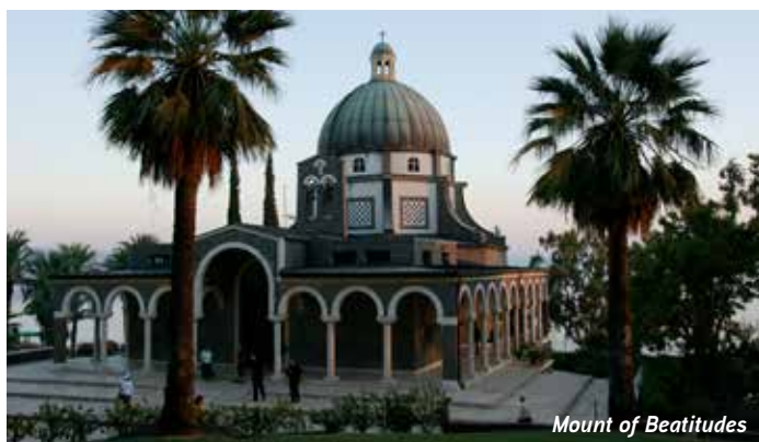
Mount of Beatitudes